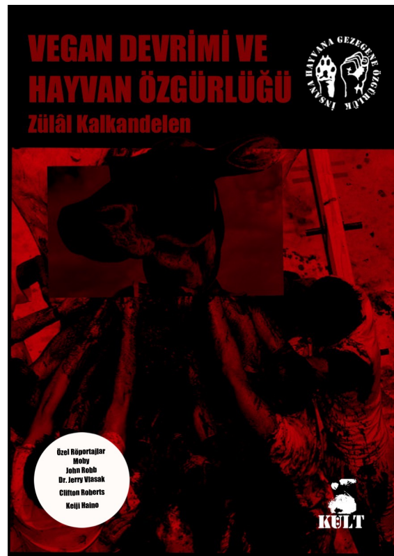
Vegan Devrimi ve Hayvan Özgürlüğü; Vegan Revolution and Animal Liberation (2018)